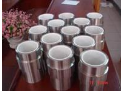
cylinder for mud pump