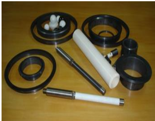
silicon carbide and alumina ceramic