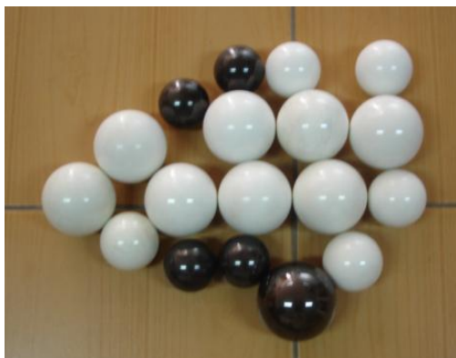
ceramic ball for bearing use